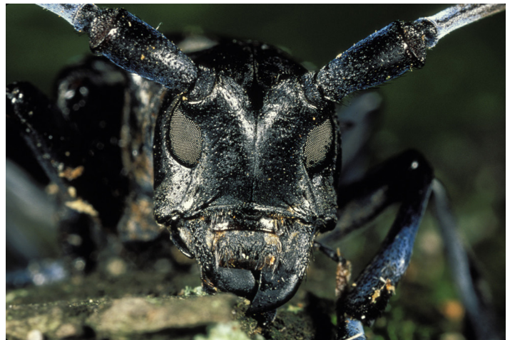
Figure 3. Asian longhorned beetle ( Anoplophora glabripennis ).

The United States Department of Agriculture and Customs and Border Protection inspect imported agricultural products for insect “hitchhikers.” The ALB is currently