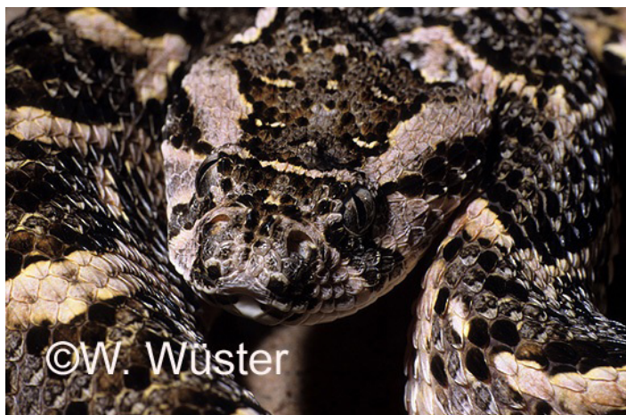
Figure 2. Puff adder ( Bitis arietans ).

This venomous snake was identified as a potential invader because it is frequently imported and difficult to manage as a pet. If it establishes in Florida, this species poses danger to humans and the ecosystem. In Africa, puff adders are