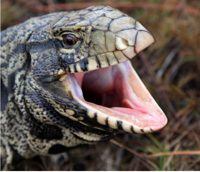
Figure 5. Argentine black and white tegu ( Tupinambis merianae ).

Tegus have established populations in south Florida and are expanding to new areas. To stop the spread, managers are removing tegus, monitoring the populations, and educating the public about reporting tegus. These large lizards were introduced through the pet trade and are a threat to native wildlife.