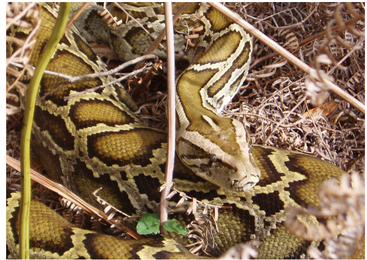
Figure 7. Burmese python ( Python molurus bivittatus ).

management option currently exists to remove pythons year-round across the landscape.