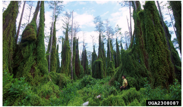
Figure 6. Old World climbing fern ( Lygodium microphyllum ).

Burmese pythons eat a variety of prey including endangered species, and may be responsible for a severe decline of mammals in the Everglades. Despite considerable research and development of control methods, no effective