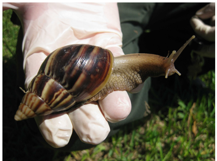
Figure 4. Giant African land snail ( Lissachatina fulica ).