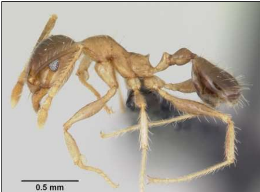
Figure 2. African Big-headed Ant ( Pheidole megacephala ) minor worker.