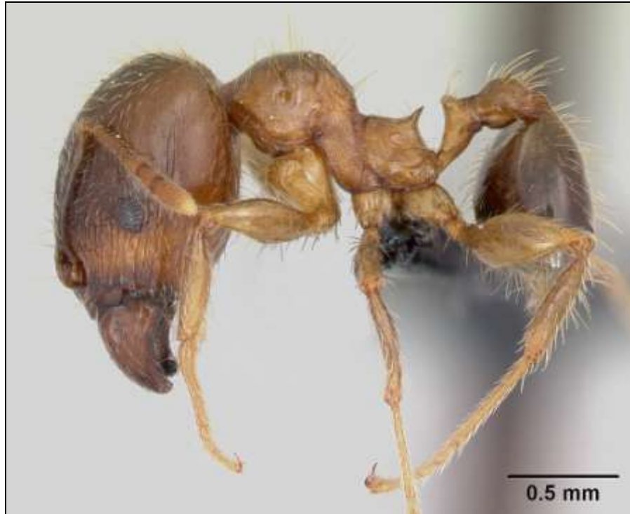
Figure 1. African Big-headed Ant ( Pheidole megacephala ) major worker.